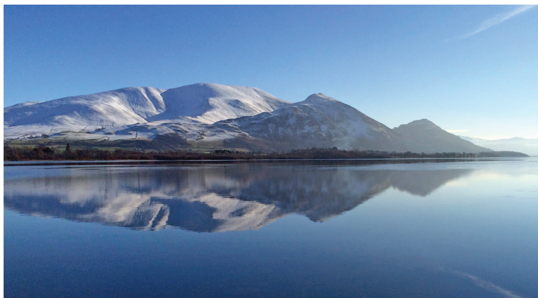
Figure 1: Research-into-music and music-into-research

Research into the role of music as a therapeutic intervention – for example in the hospital experience of older people (Al-Jawad et al., 2020) and in dementia care (Pithie, 2016) – can be found in the practice development literature. Coming from another direction is a consideration of how arts-based practice, including 'music as method' (Leavy, 2020, p 128), contributes into research . Figure 1 represents a reflection between 'research-into-music' and 'music-into-research'; in other words, the two are not mutually exclusive, and should be seen as complementary reflections of each other.