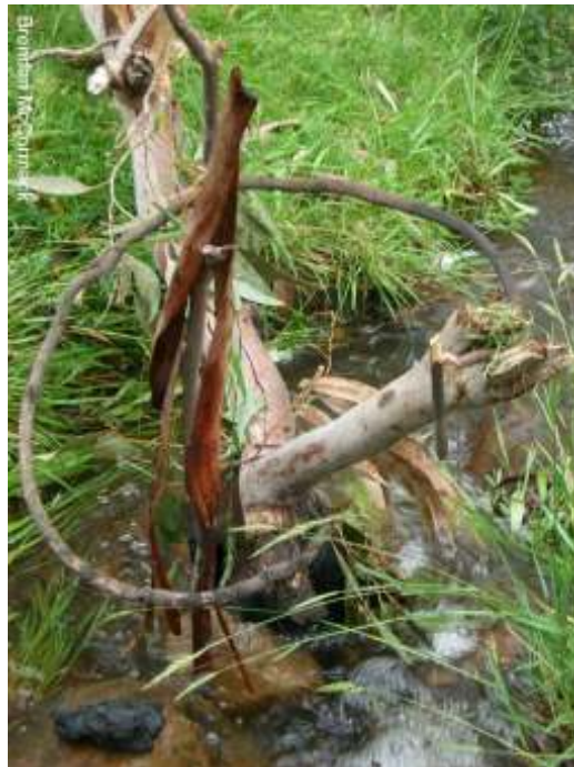
Figure 6. Sculpture symbolising critical creativity through the interplay and energies of wood, fire, earth, metal and water.