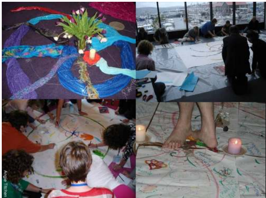
Figure 3. Artistic critique of the methodological framework.

By embodying the framework, as critical companions, we provided people with an experience of the framework through these methods which, at the same time, were means of gathering, synthesising and critiquing data. At our retreats, we were able to supplement these data with reflective notes, post-retreat reflective writing and audio-recordings. We undertook further synthesis of data through