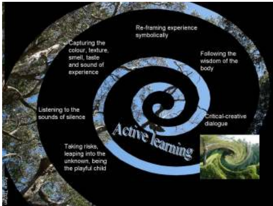
Figure 2. Principles for using critical-creative methods.

body, creative expression, reflection, critical dialogue and contestation in order to develop understanding and a re-iterative, reciprocal dialogue between words and art forms.