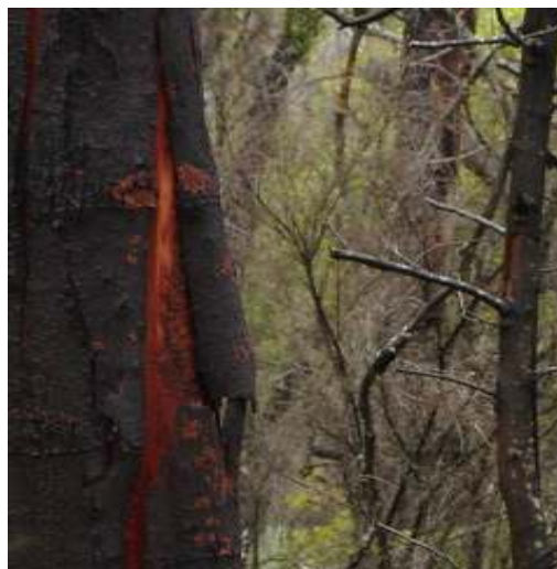
Figure 1. Connecting with nature is central in a critical creativity worldview.