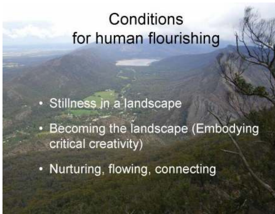
Figure 5. Three conditions for human flourishing.

The three conditions are shown in Figure 5: