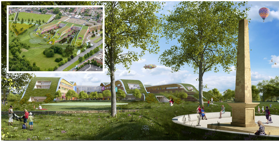
Figure 3: Images of the planned Alder Hey Children's Health Park in Liverpool

To evaluate the impact of the new environment on children postoperatively, data would need to be collected and comparisons made between the new and the old hospital environments. Most pain teams collect data on their practice, which could be used as a baseline for comparisons in the new environment. Another UK example of a hospital built around the child's perspective is the Evelina Children's Hospital in London, which has won awards for its design and is credited with being full of colour and light (Guys and St Thomas', 2012).