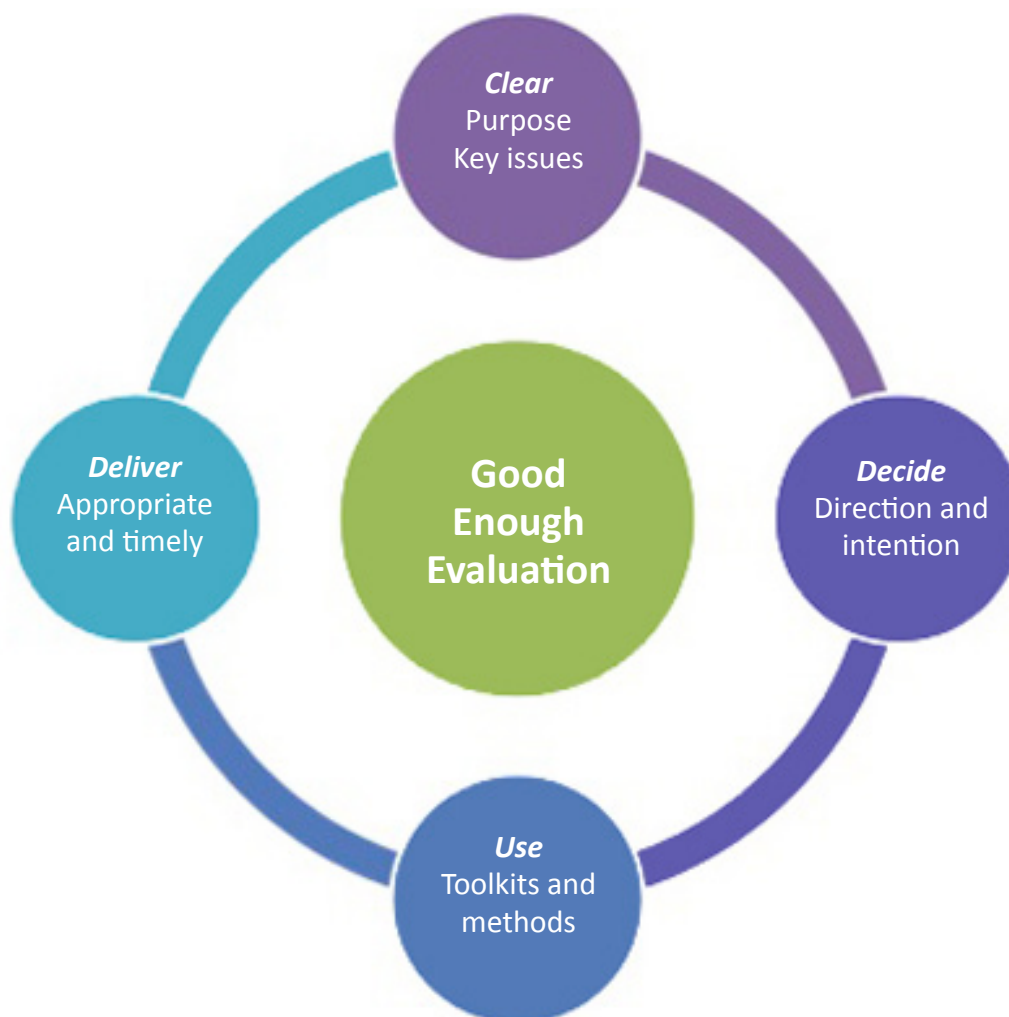
Figure 2: Good Enough Evaluation framework

With these complexities in mind, we are proposing a framework that helps guide staff take a 'good enough' approach to evaluation. The framework (see Figure 2) has been developed as part of an international community of practice and has been driven by our desire to make evaluation more accessible to staff engaged in practice development work. The process has four key elements (Clear, Decide, Use and Deliver) and should be used to frame the evaluation in advance of the implementation of a practice development initiative.